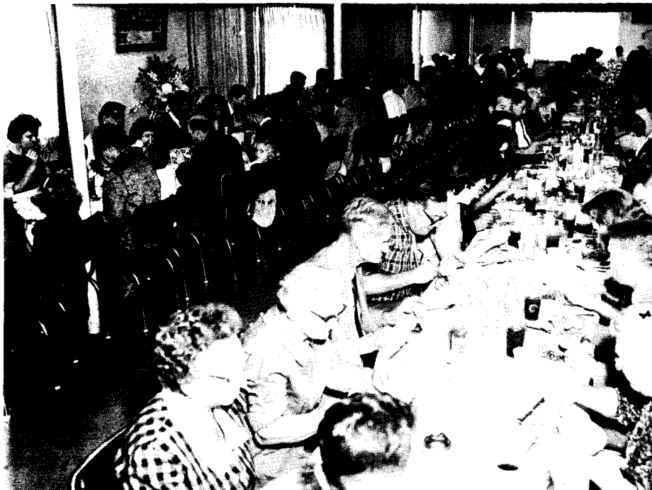
The brethren meeting in Opp enjoy one of their meals during the Feast.

"The National Guard Armory worked out splendidly. It was just like owning our own Tabernacle for the eight days. We had absolute privacy, use of the entire building, and were not disturbed by one intruder during the entire time. They say such is unusual in a commu-