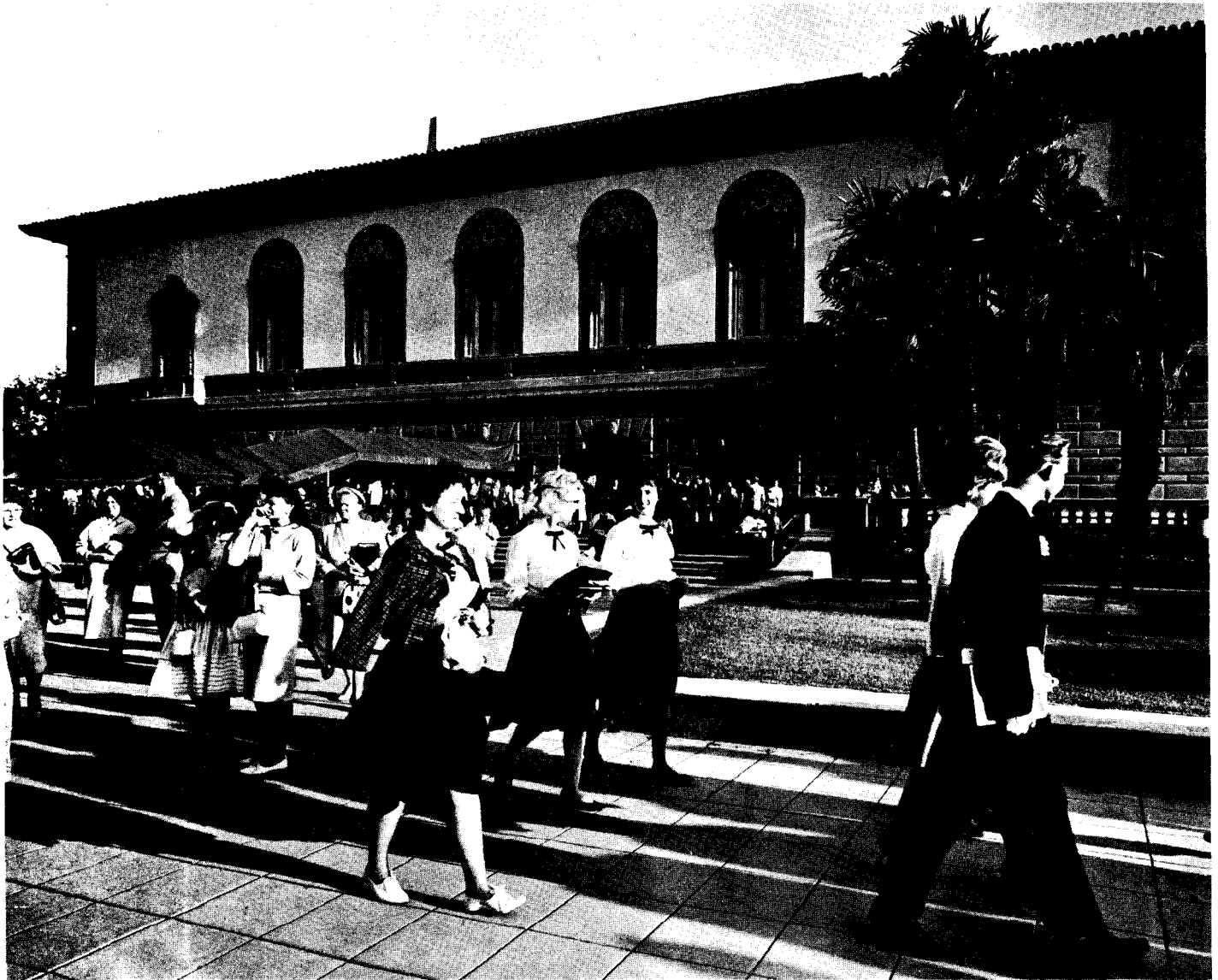
Outside view of the Civic Auditorium showing brethren and Ambassador students leaving one of the services.

brethren in attendance even on the weekly Sabbath to hear the sermons. Many had come in from Wisconsin, Minnesota, Iowa, Nebraska, Michigan, Indiana, Kentucky, and other outlying states to attend the entire Festival in Chicago.