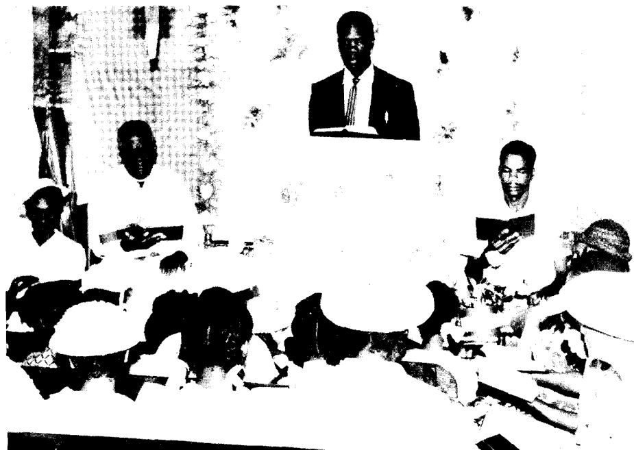
Notice the festive atmosphere in the Unleavened Bread service of our brethren in the West Indies.