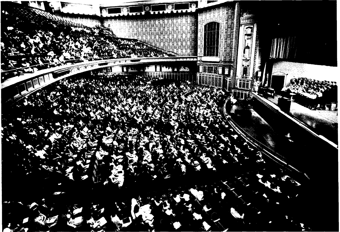
Over 2000 brethren assemble in beautiful Pasadena Civic Auditorium — with Ambassador Chorale on stage. This was on first Holy Day of the Feast of Unleavened Bread.