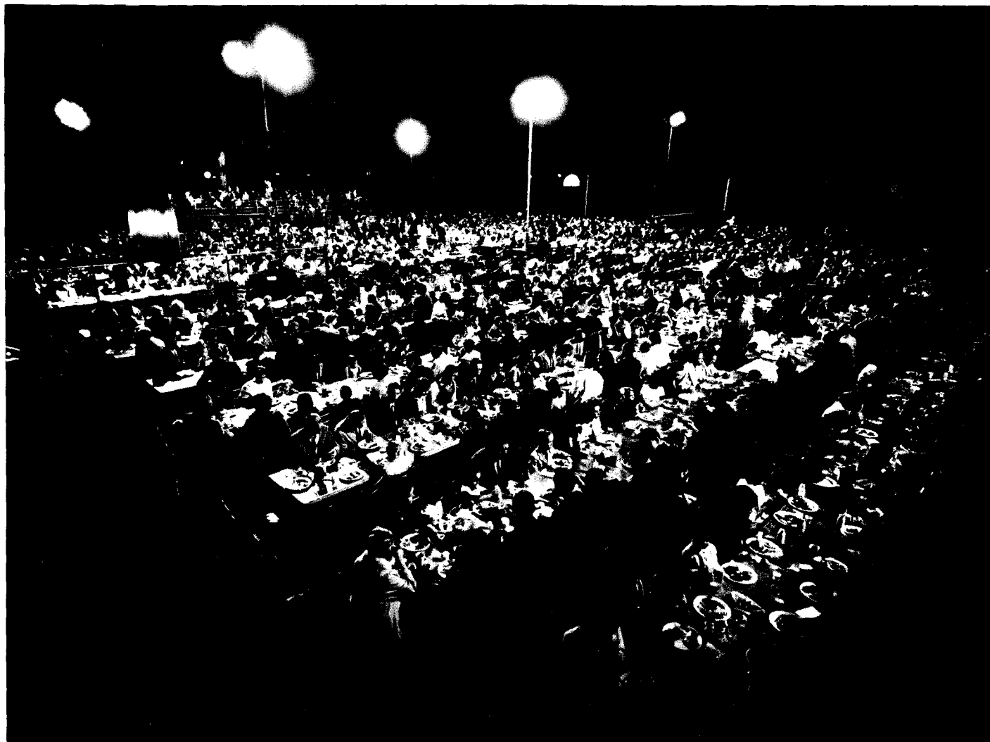
The delicious feast on the "Night to be Remembered" was enjoyed on the tennis courts of Ambassador College in Pasadena.

"We were blessed with splendid cooperation from all deacons, deaconesses,